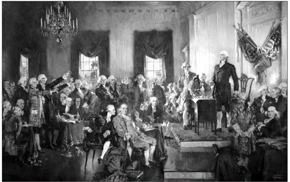
Delegates at the Constitutional Convention wait their turns to sign the U.S. Constitution.

In February 1787, Congress decided that a convention should be convened to revise the Articles of Confederation, the nation's first constitution. In May, 55 delegates came to Philadelphia, and the Constitutional Convention began. Debates erupted over representation in Congress, over slavery, and over the new executive branch. The debates continued through four hot and muggy months. But eventually the delegates reached compromises, and on September 17, they produced the U.S. Constitution, replacing the Articles with the governing document that has functioned effectively for more than 200 years.